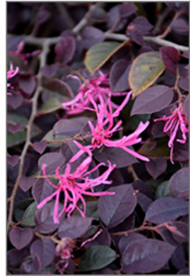
Crimson Fire Chinese Fringeflower flowers

This plant is not reliably hardy in our region, and certain restrictions may apply; contact the store for more information.