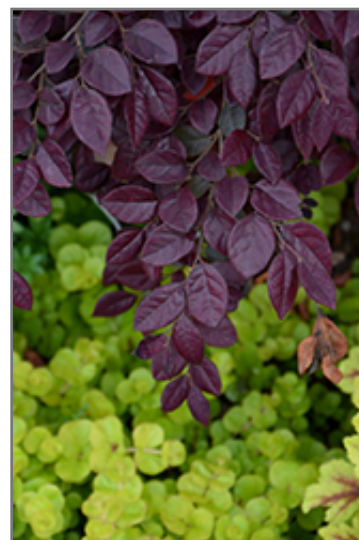
Crimson Fire Chinese Fringeflower foliage