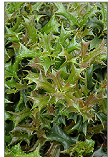
Rotunda Chinese Holly foliage