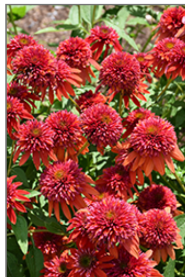
Double Scoop Orangeberry Coneflower flowers

Double Scoop Orangeberry Coneflower is recommended for the following landscape applications;