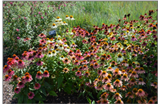
Cheyenne Spirit Coneflower in bloom

Cheyenne Spirit Coneflower will grow to be about 16 inches tall at maturity extending to 24 inches tall with the flowers, with a spread of 18 inches. Its foliage tends to remain dense right to the ground, not requiring facer plants in front. It grows at a medium rate, and under ideal conditions can be expected to live for approximately 10 years. As an herbaceous perennial, this plant will usually die back to the crown each winter, and will regrow from the base each spring. Be careful not to disturb the crown in late winter when it may not be readily seen!