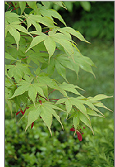
Osakazuki Japanese Maple foliage

This plant is not reliably hardy in our region, and certain restrictions may apply; contact the store for more information.