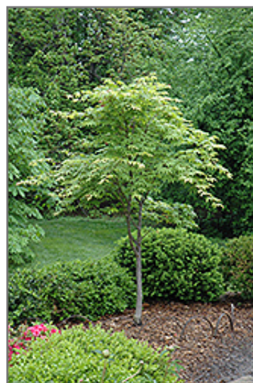
Osakazuki Japanese Maple