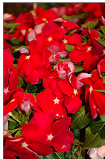
Cora Red Vinca flowers