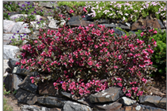
Tango Weigela in bloom

Tango Weigela is recommended for the following landscape applications;