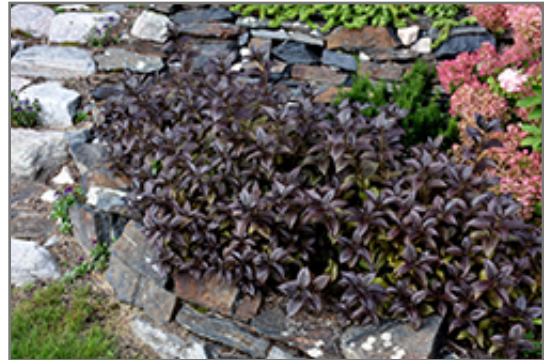
Tango Weigela

Tango Weigela makes a fine choice for the outdoor landscape, but it is also well-suited for use in outdoor pots and containers. With its upright habit of growth, it is best suited for use as a 'thriller' in the 'spiller-thriller-filler' container combination; plant it near the center of the pot, surrounded by smaller plants and those that spill over the edges. It is even sizeable enough that it can be grown alone in a suitable container. Note that when grown in a container, it may not perform exactly as indicated on the tag - this is to be expected. Also note that when growing plants in outdoor containers and baskets, they may require more frequent waterings than they would in the yard or garden. Be aware that in our climate, most plants cannot be expected to survive the winter if left in containers outdoors, and this plant is no exception. Contact our experts for more information on how to protect it over the winter months.