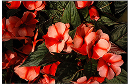
Harmony Salmon Cream New Guinea Impatiens flowers

Harmony Salmon Cream New Guinea Impatiens is recommended for the following landscape applications;