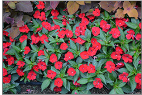
SunPatiens Compact Red New Guinea Impatiens in bloom

SunPatiens Compact Red New Guinea Impatiens will grow to be about 24 inches tall at maturity, with a spread of 24 inches. When grown in masses or used as a bedding plant, individual plants should be spaced approximately 20 inches apart. Its foliage tends to remain dense right to the ground, not requiring facer plants in front. This fast-growing annual will normally live for one full growing season, needing replacement the following year.