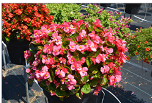
Super Olympia Rose Begonia in bloom