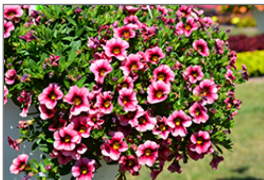
Hula Hot Pink Calibrachoa flowers