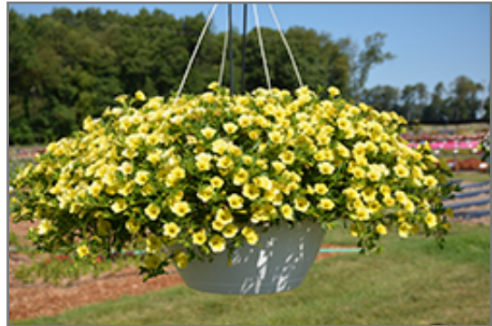
Million Bells Trailing Yellow Calibrachoa in bloom

Million Bells Trailing Yellow Calibrachoa is a fine choice for the garden, but it is also a good selection for planting in outdoor containers and hanging baskets. Because of its trailing habit of growth, it is ideally suited for use as a 'spiller' in the 'spiller-thriller-filler' container combination; plant it near the edges where it can spill gracefully over the pot. It is even sizeable enough that it can be grown alone in a suitable container. Note that when growing plants in outdoor containers and baskets, they may require more frequent waterings than they would in the yard or garden.