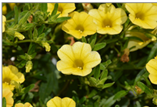
Million Bells Trailing Yellow Calibrachoa flowers

This plant will require occasional maintenance and upkeep. Trim off the flower heads after they fade and die to encourage more blooms late into the season. It is a good choice for attracting bees and hummingbirds to your yard, but is not particularly attractive to deer who tend to leave it alone in favor of tastier treats. It has no significant negative characteristics.