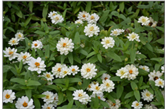
Profusion Double White Zinnia flowers