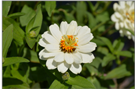
Profusion Double White Zinnia flowers

Profusion Double White Zinnia is a fine choice for the garden, but it is also a good selection for planting in outdoor containers and hanging baskets. It is often used as a 'filler' in the 'spiller-thriller-filler' container combination, providing a mass of flowers against which the larger thriller plants stand out. Note that when growing plants in outdoor containers and baskets, they may require more frequent waterings than they would in the yard or garden.