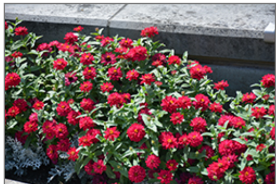
Profusion Double Hot Cherry Zinnia in bloom