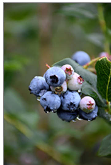
Chippewa Blueberry fruit

This is a multi-stemmed deciduous shrub with an upright spreading habit of growth. Its relatively fine texture sets it apart from other landscape plants with less refined foliage. This is a relatively low maintenance plant, and usually looks its best without pruning, although it will tolerate pruning. It is a good choice for attracting birds to your yard. It has no significant negative characteristics.