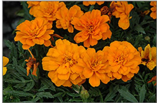
Durango Tangerine Marigold flowers