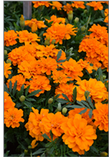
Durango Tangerine Marigold flowers

Durango Tangerine Marigold is a fine choice for the garden, but it is also a good selection for planting in outdoor pots and containers. It is often used as a 'filler' in the 'spiller-thriller-filler' container combination, providing a mass of flowers against which the larger thriller plants stand out. Note that when growing plants in outdoor containers and baskets, they may require more frequent waterings than they would in the yard or garden.