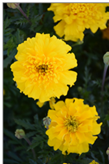
Cresta Yellow Marigold flowers