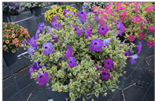
Glamouflage Grape Petunia in bloom