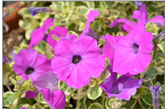
Glamouflage Grape Petunia flowers

Glamouflage Grape Petunia is recommended for the following landscape applications;