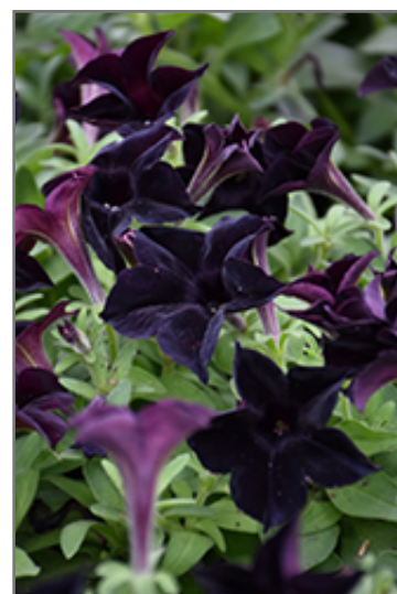
Black Ray Petunia flowers