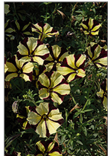
Sunflower Ray Petunia flowers