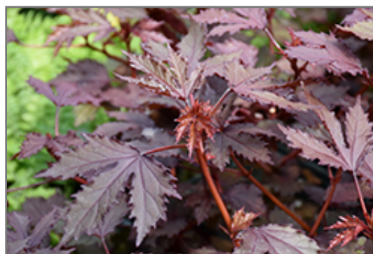
Mahogany Splendor Hibiscus foliage