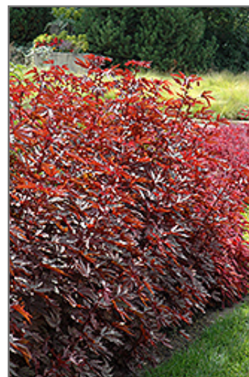
Mahogany Splendor Hibiscus

Mahogany Splendor Hibiscus is recommended for the following landscape applications;