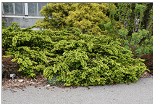
Emerald Spreader Yew