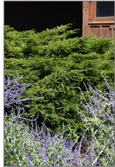
Emerald Spreader Yew

This plant is not reliably hardy in our region, and certain restrictions may apply; contact the store for more information.