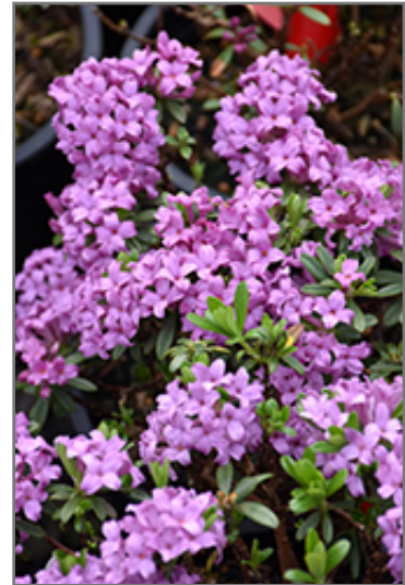
Lawrence Crocker Daphne flowers