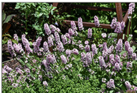
Pink Cotton Candy Betony in bloom

Pink Cotton Candy Betony will grow to be about 8 inches tall at maturity extending to 24 inches tall with the flowers, with a spread of 20 inches. When grown in masses or used as a bedding plant, individual plants should be spaced approximately 15 inches apart. It grows at a medium rate, and under ideal conditions can be expected to live for approximately 5 years. As an herbaceous perennial, this plant will usually die back to the crown each winter, and will regrow from the base each spring. Be careful not to disturb the crown in late winter when it may not be readily seen!