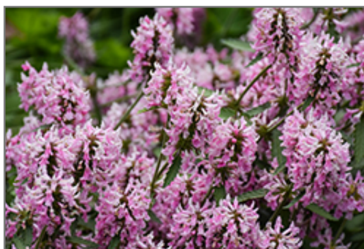
Pink Cotton Candy Betony flowers