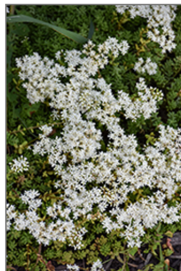
Baby Tears Stonecrop flowers

Baby Tears Stonecrop is recommended for the following landscape applications;