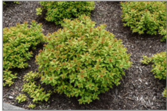
Dakota Goldcharm Spirea

This shrub should only be grown in full sunlight. It prefers to grow in average to moist conditions, and shouldn't be allowed to dry out. It is not particular as to soil type or pH. It is highly tolerant of urban pollution and will even thrive in inner city environments. This is a selected variety of a species not originally from North America.