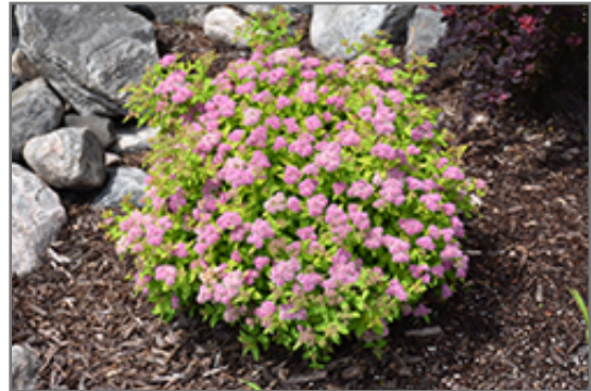
Dakota Goldcharm Spirea in bloom

Dakota Goldcharm Spirea is recommended for the following landscape applications;