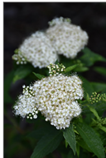
Japanese White Spirea flowers