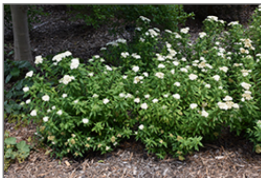
Japanese White Spirea in bloom