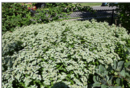
Short Toothed Mountain Mint in bloom