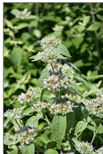
Short Toothed Mountain Mint flowers

Short Toothed Mountain Mint is recommended for the following landscape applications;