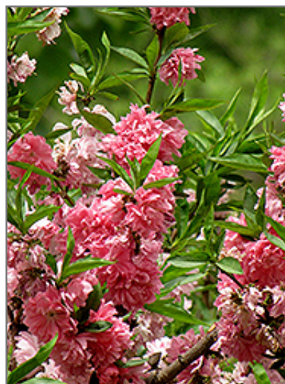
Klara Meyer Flowering Peach flowers

Klara Meyer Flowering Peach is recommended for the following landscape applications;