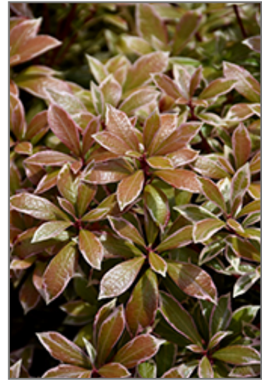
Little Heath Japanese Pieris foliage

This plant is not reliably hardy in our region, and certain restrictions may apply; contact the store for more information.