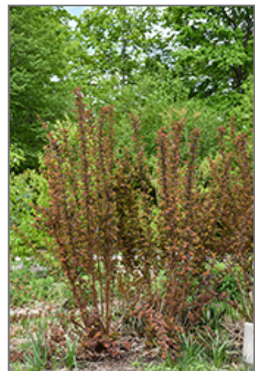
Mahogany Magic Ninebark