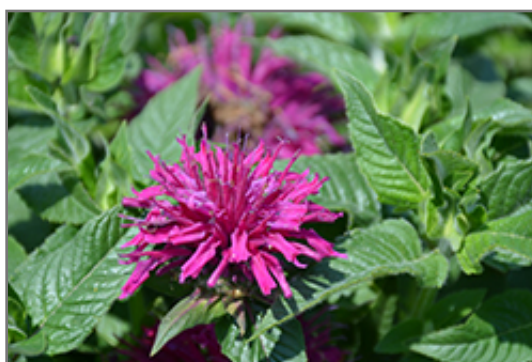
Pardon My Purple Beebalm flowers