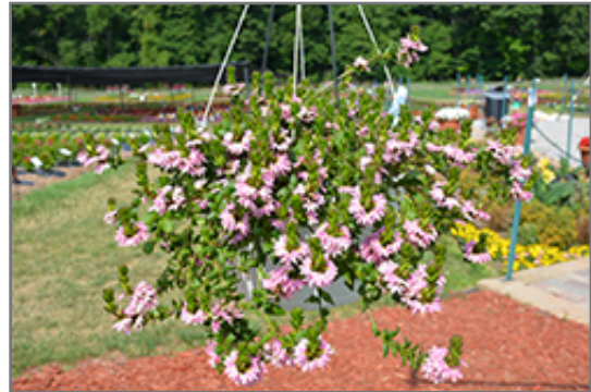
Bombay Pink Fan Flower in bloom

Bombay Pink Fan Flower is a fine choice for the garden, but it is also a good selection for planting in outdoor containers and hanging baskets. Because of its trailing habit of growth, it is ideally suited for use as a 'spiller' in the 'spiller-thriller-filler' container combination; plant it near the edges where it can spill gracefully over the pot. Note that when growing plants in outdoor containers and baskets, they may require more frequent waterings than they would in the yard or garden.