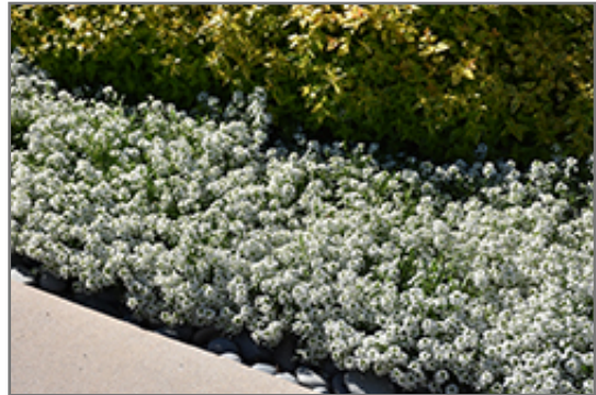
Snow Princess Alyssum in bloom

Snow Princess Alyssum is a fine choice for the garden, but it is also a good selection for planting in hanging baskets. Because of its trailing habit of growth, it is ideally suited for use as a 'spiller' in the 'spiller-thriller-filler' container combination; plant it near the edges where it can spill gracefully over the pot. Note that when growing plants in outdoor containers and baskets, they may require more frequent waterings than they would in the yard or garden.