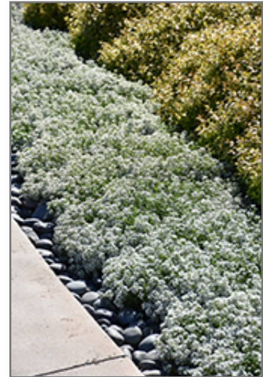
Snow Princess Alyssum in bloom

Snow Princess Alyssum is recommended for the following landscape applications;