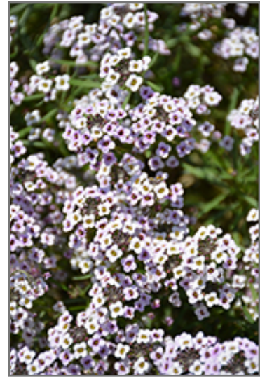
Blushing Princess Sweet Alyssum flowers

Blushing Princess Sweet Alyssum is a fine choice for the garden, but it is also a good selection for planting in hanging baskets. Because of its trailing habit of growth, it is ideally suited for use as a 'spiller' in the 'spiller-thriller-filler' container combination; plant it near the edges where it can spill gracefully over the pot. Note that when growing plants in outdoor containers and baskets, they may require more frequent waterings than they would in the yard or garden.