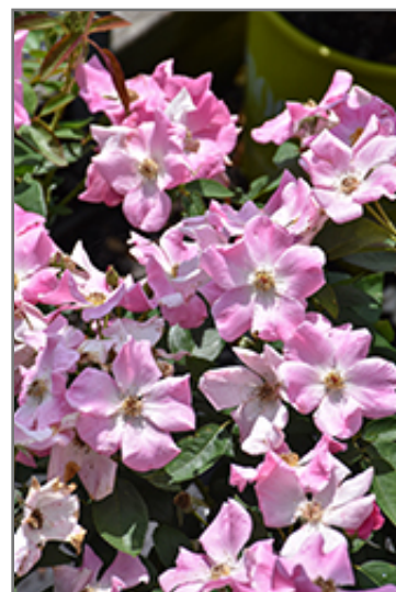
Nearly Wild Rose flowers