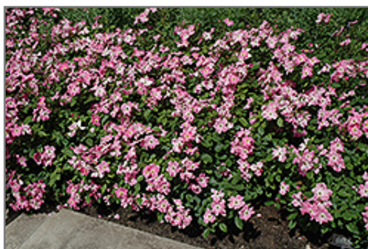
Nearly Wild Rose in bloom