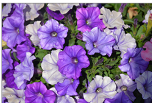
Shock Wave Denim Petunia flowers