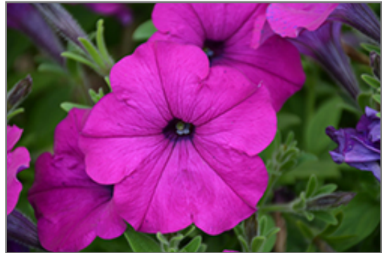
Easy Wave Violet Petunia flowers

Easy Wave Violet Petunia will grow to be about 12 inches tall at maturity, with a spread of 30 inches. When grown in masses or used as a bedding plant, individual plants should be spaced approximately 24 inches apart. Its foliage tends to remain dense right to the ground, not requiring facer plants in front. This fast-growing annual will normally live for one full growing season, needing replacement the following year.