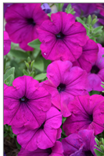
Easy Wave Violet Petunia flowers