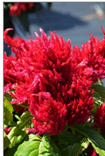
Ice Cream Cherry Celosia flowers

Ice Cream Cherry Celosia is recommended for the following landscape applications;