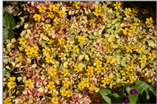
Molten Lava Shamrock in bloom