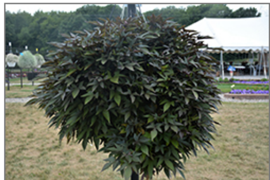
Sidekick Black Sweet Potato Vine