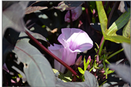
Sidekick Black Sweet Potato Vine flowers

Sidekick Black Sweet Potato Vine is a fine choice for the garden, but it is also a good selection for planting in outdoor containers and hanging baskets. Because of its trailing habit of growth, it is ideally suited for use as a 'spiller' in the 'spiller-thriller-filler' container combination; plant it near the edges where it can spill gracefully over the pot. Note that when growing plants in outdoor containers and baskets, they may require more frequent waterings than they would in the yard or garden.