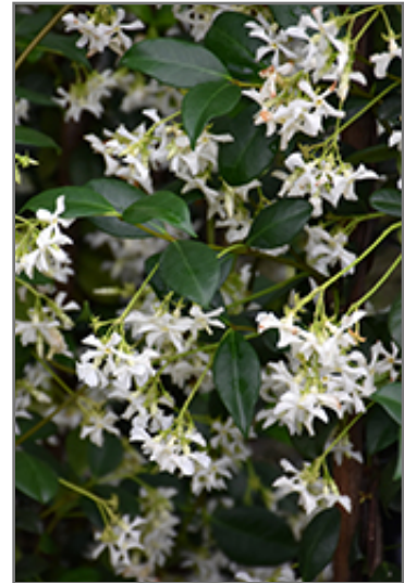
Confederate Star-Jasmine flowers