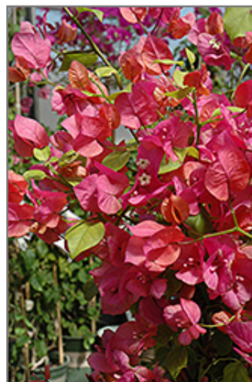
James Walker Bougainvillea flowers