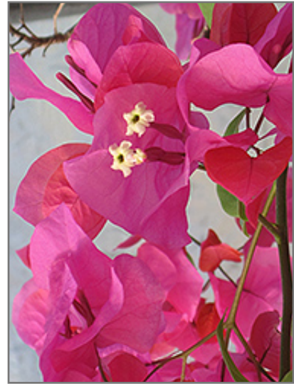
James Walker Bougainvillea flowers

James Walker Bougainvillea is a fine choice for the garden, but it is also a good selection for planting in outdoor containers and hanging baskets. Because of its spreading habit of growth, it is ideally suited for use as a 'spiller' in the 'spiller-thriller-filler' container combination; plant it near the edges where it can spill gracefully over the pot. It is even sizeable enough that it can be grown alone in a suitable container. Note that when growing plants in outdoor containers and baskets, they may require more frequent waterings than they would in the yard or garden.