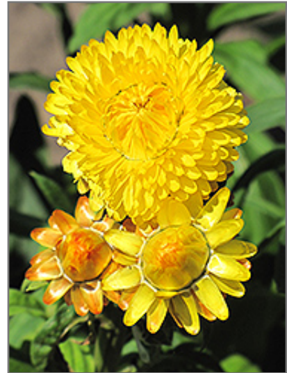
Dreamtime Jumbo Yellow Strawflower flowers