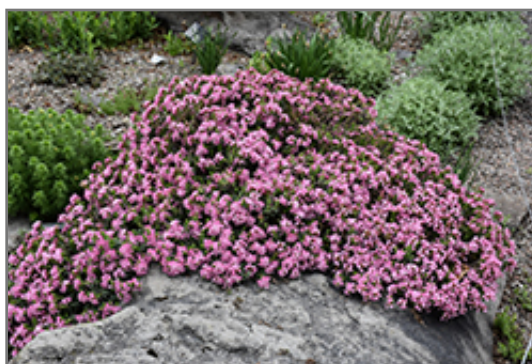
Rose Daphne in bloom