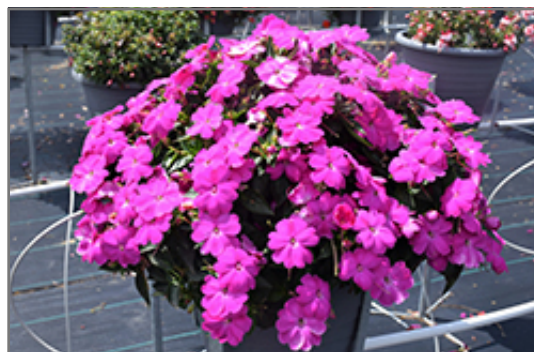
SunPatiens Compact Lilac New Guinea Impatiens in bloom