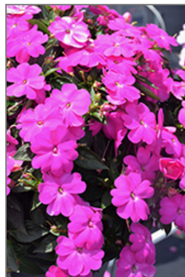
SunPatiens Compact Lilac New Guinea Impatiens flowers

SunPatiens Compact Lilac New Guinea Impatiens is recommended for the following landscape applications;