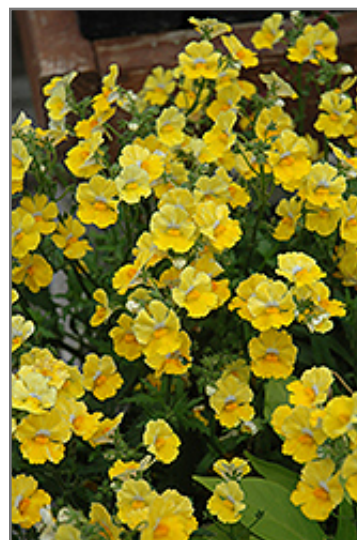
Sunsatia Lemon Nemesia flowers