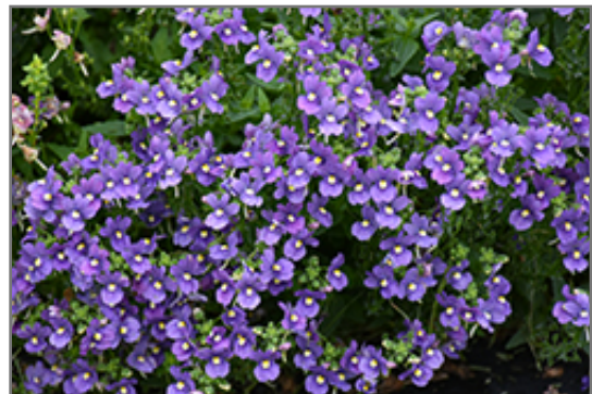
Bluebird Nemesia flowers