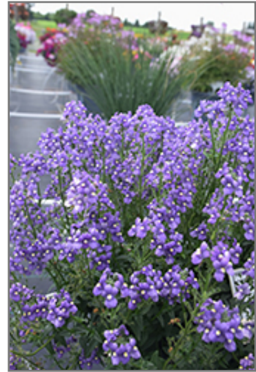
Bluebird Nemesia flowers