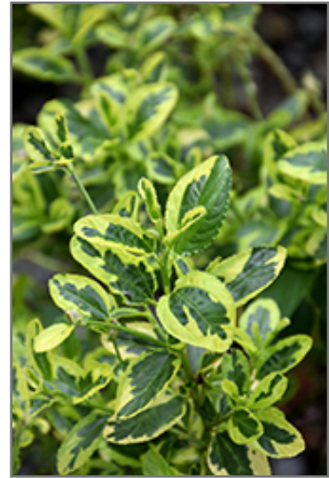
Diamond Heights California Lilac foliage

This plant is not reliably hardy in our region, and certain restrictions may apply; contact the store for more information.