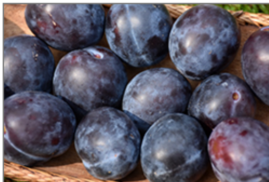
Mount Royal Plum fruit

Mount Royal Plum is draped in stunning clusters of fragrant white flowers along the branches in early spring before the leaves. It has dark green deciduous foliage. The pointy leaves turn yellow in fall. The fruits are showy blue drupes with purple overtones, which are carried in abundance in late summer. The fruit can be messy if allowed to drop on the lawn or walkways, and may require occasional clean-up.