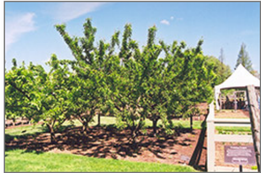
Mount Royal Plum

This plant is not reliably hardy in our region, and certain restrictions may apply; contact the store for more information.